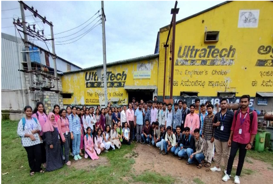
SGR Industry visit by 4 th sem students