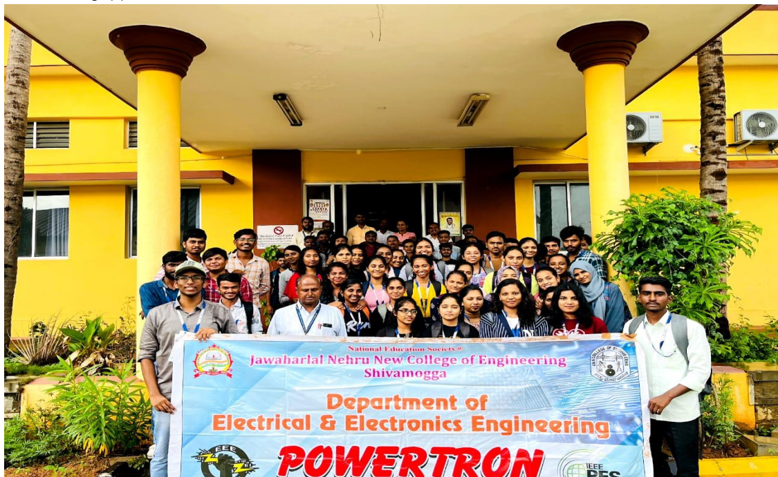
MRS Visit by 6 th sem students