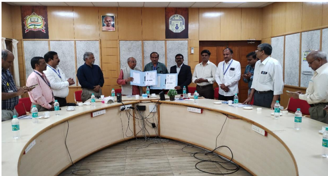
MOU with AEEKS Infotech Pvt Ltd.