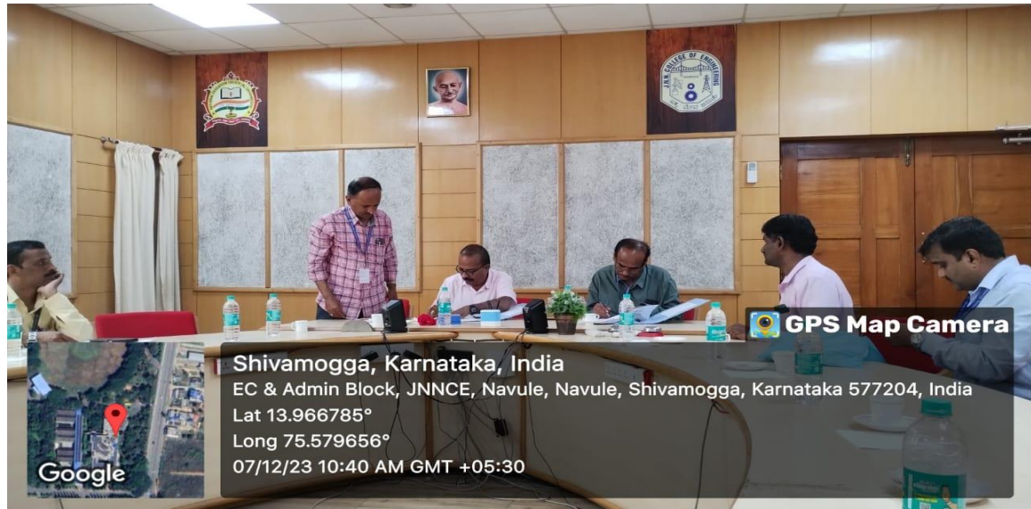
MOU with SGR Industries