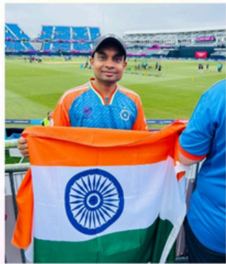
ALUMNI JNNCE-MBA BATCH 2001-2003.