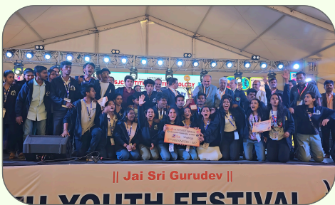
Participation in VTU Youth Festival, Blissbeat-2024