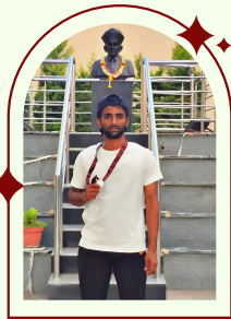
Krushik Silver-VTU Athletic Meet