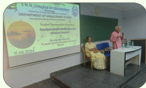
Guest Lecture on "Aanapanasathi Meditation and Wisdom"