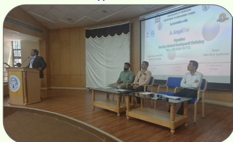
Bull and Bear Battle