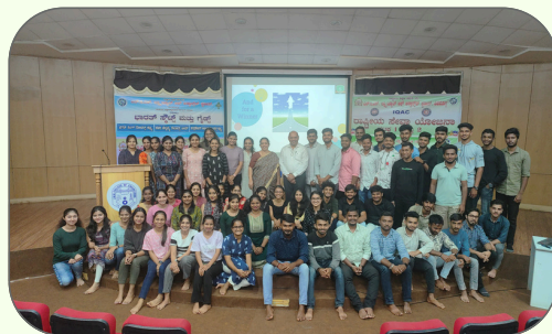
"Identifying the Stars Within You!"