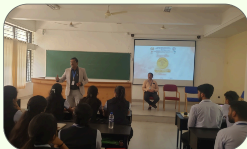
Inauguration of Digital Marketing Lab