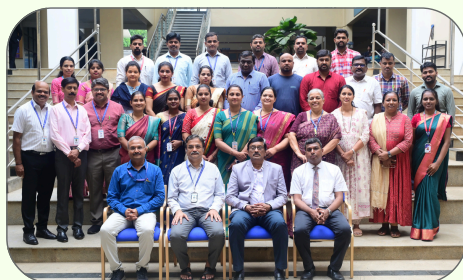
2 Days FDP on Gamification-Alternative Andragogy-The Experiential Learning through Gamification & Case study Training