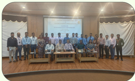
Mega Job Fair