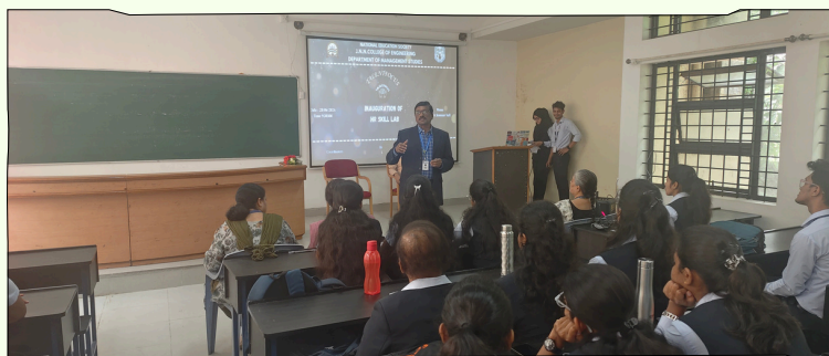
Inauguration of HR Skill Lab