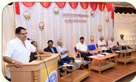
First Year MBA Orientation-21st February, 2024