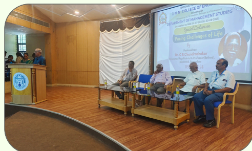
Guest Lecture on "Facing the Challenges of Life"