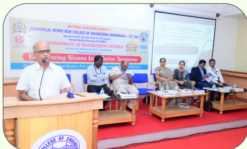
National Seminar on "Empowering Women for a Better Tomorrow"