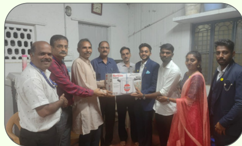
Visit to Good Luck Araiike Kendra, Shivamogga