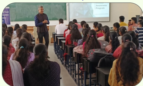
Financial Analytics and Marketing Analytics