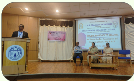
Holistic Approach to Wellness