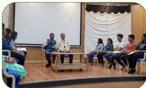
Guest Lecture on "Interactive Leadership"