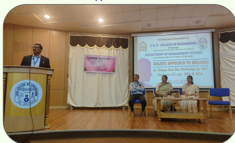
Holistic Approach to Wellness