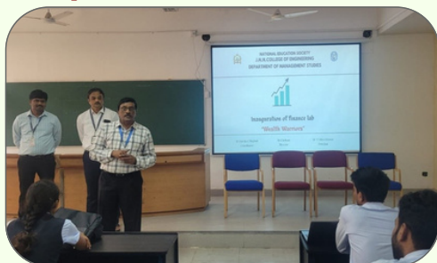
Inauguration of Wealth Warriors-The Finance Club