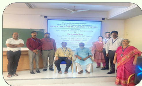
Guest Lecture on "Insights & outsgights of Entrepreneurship"