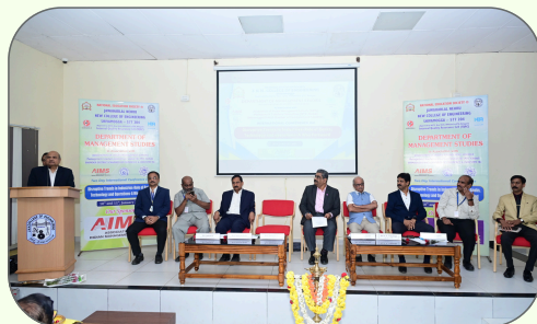
International Conference on "Disruptive Trends in Industries-Role of Banks, Technology and operations-A Way Forward"