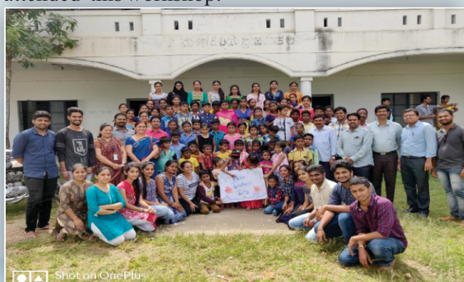
Teacher's Day in THARANGA DEAF & DUMB School 05-09-2018