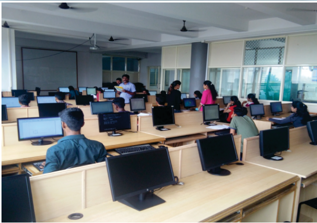
Recently set-up CAD and CIM laboratory