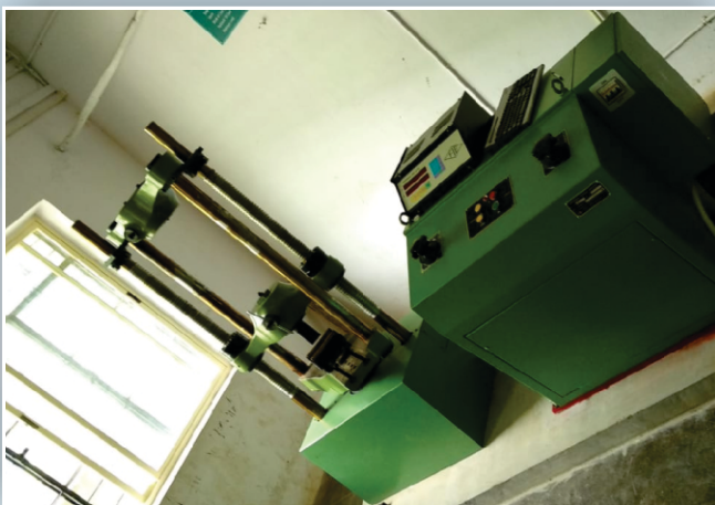
Universal Testing Machine