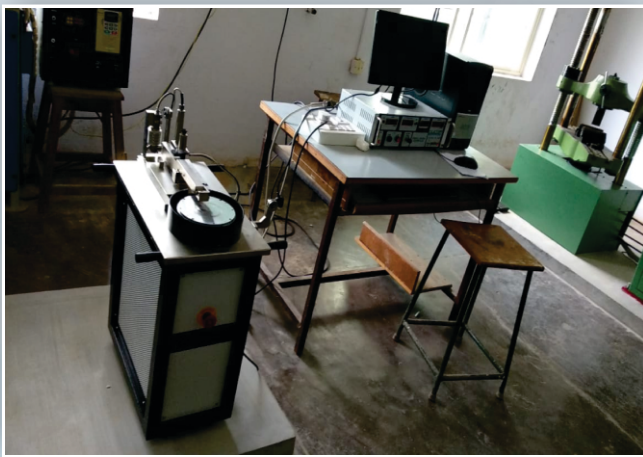
DUCOM WEAR testing Machine