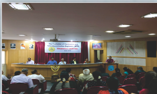
Internet awareness Workshop for Senior citizens & women on 15-09-2018