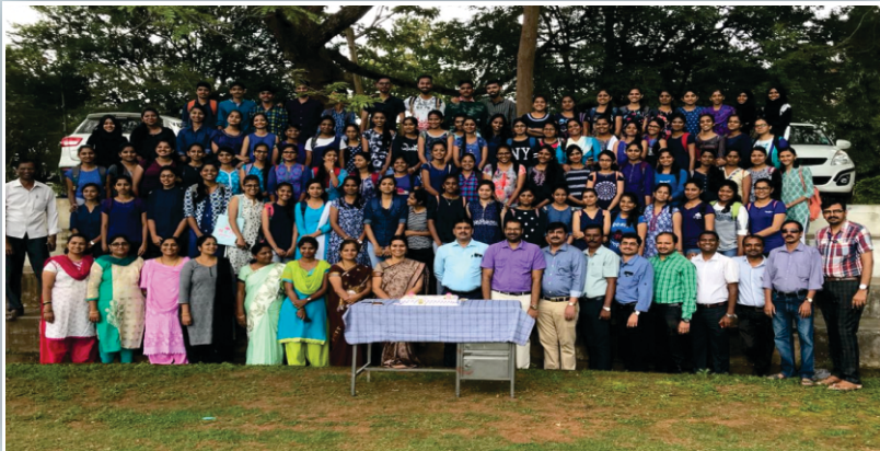
Teacher's Day Celebration by Information Science Engineering final year students