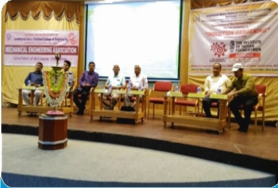
Workshop on "Induction Hardening" for Mechanical Engineering students on 13-03-2019 In association with MEA and IIF Shlmoaga chapter In MBA seminar hall JNNCE.