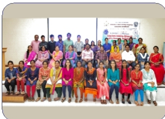
Participants of the LTE-A Workshop