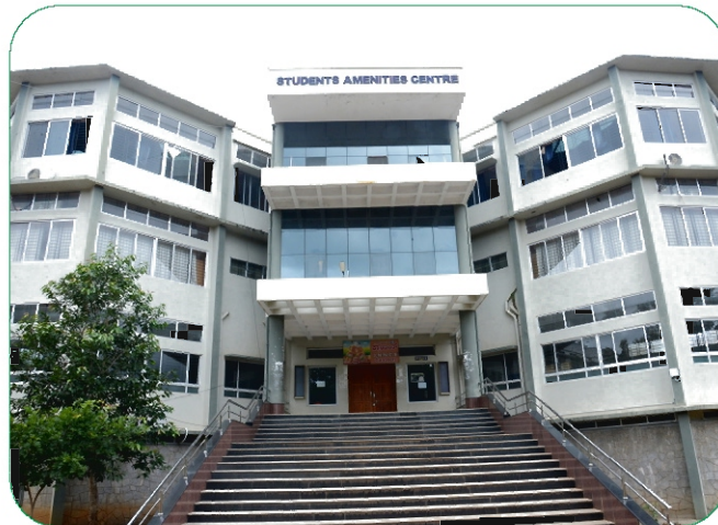
STUDENTS AMENITIES CENTRE