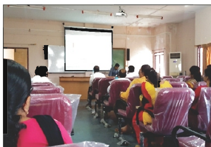
Department has organized a "Internet Awareness program" for Public on 30-03-2019.