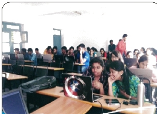
Two days workshop on ADOBE PHOTOSHOP on 28.2.2019 and 1.3.2019