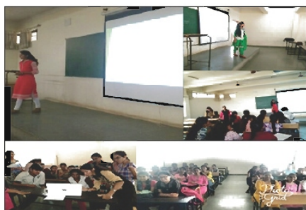
2 days DBMS workshop titled "First step towards DBMS project" carried out by prefinal year students dated 10-10-2018 and 11-10-2018.