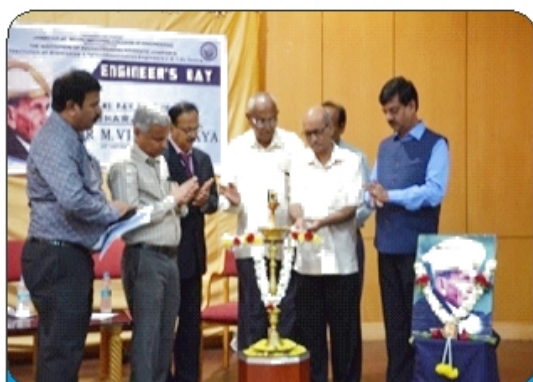
Engineers day celebrations on 30 th october 2018