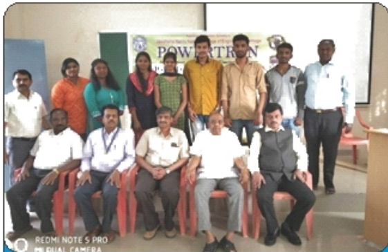
8 days Workshop on Building wiring, Electrical controls & Servicing of Home appliances on 23 rd to 31 Jan'2019