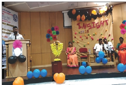
INSIGHT (departmental Forum) Inauguration on 27 th september 2018.