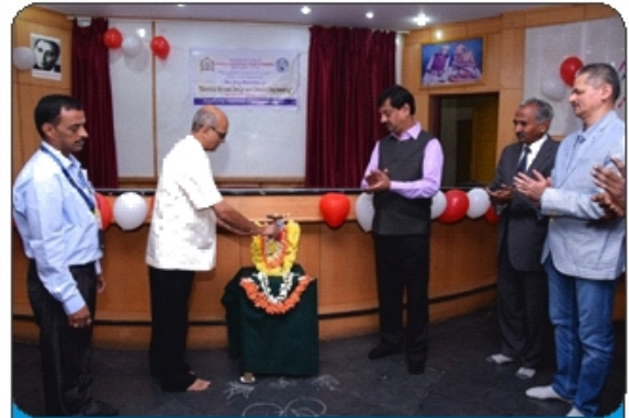
Two days Workshop on "Electrical System Design and Detailed Engineering" 29 th and 30 th Oct' 2018