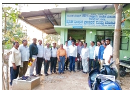
Training program is arranged for Zilla panchayath A. E. Os and car drivers.