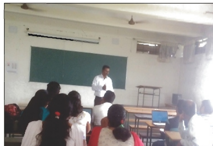
"OS Installation and Hardware Networking Workshop" conducted during 15 th , 16 th and 17 th October 2018 by Technical Staff of ISE.