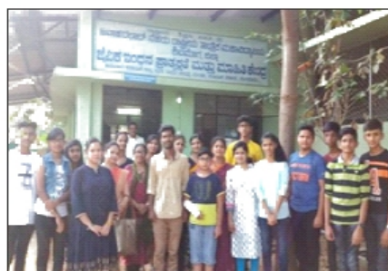
Training program arranged for Bhavasara Mission India group members.