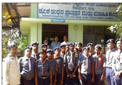
Training program carried out for Scout students of sagara taluk