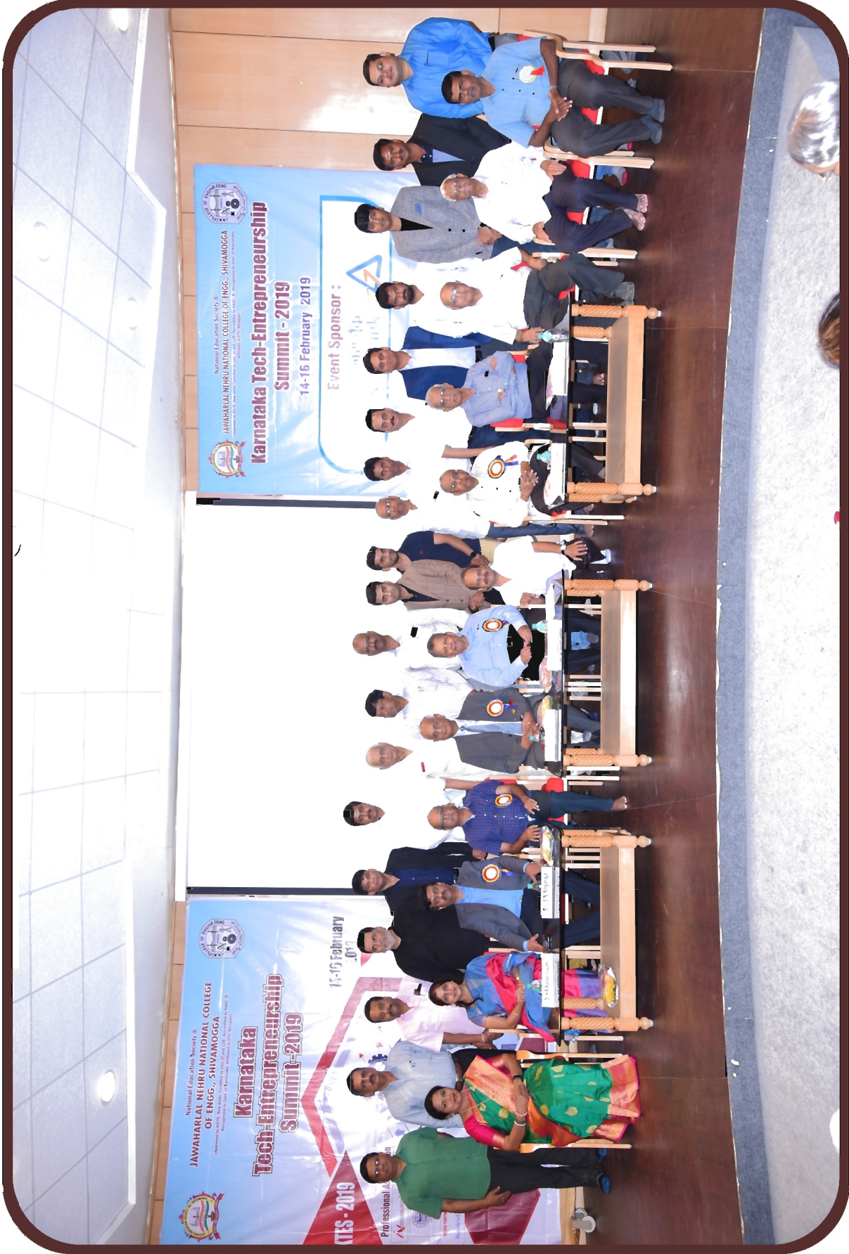
KTES 2019 AWARDEES