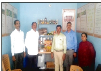
BIO-FUEL MARKETING STALL INAUGURATED AT VINOBA NAGAR.