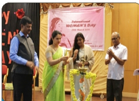
Women's day was celebrated on 15 th March 2019