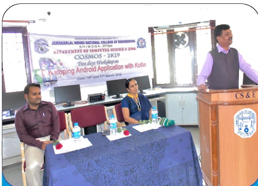
Inaugural Function of Two-day Workshop on "Developing Android Application with Kotlin" organized by COSMOS 2K19, Department of CS&E