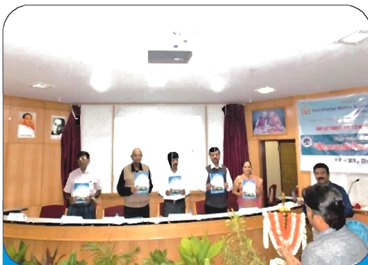
The release of Fourth Issue of the JNNCE Newsletter