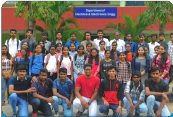
One day Basic Electrical Engg. Workshop on 16-12-2018