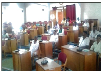
An awareness program conducted for gram panchayath president.