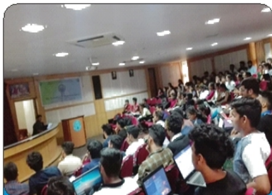
Two days workshop on ETHICAL HACKING on 16 th and 17 th March 2019