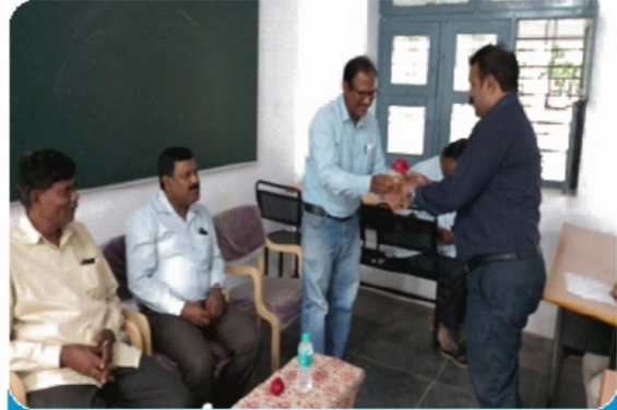
10 day worksshop on laboratory conduction for technical staff from 17th and 27th December 2018.