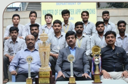
Runner up team at “INFOTSAV 2017” held at JCE, Mysuru on 28 th and 29 th October 2017