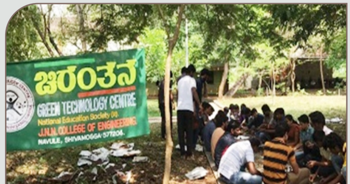
Seed ball preparation in JNNCE