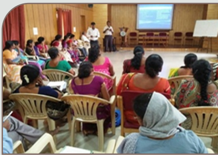
Talk at Chaitanya NGO, Alkola, Shivamogga