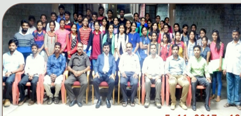
“IoT, a hands-on approach” jointly organized by Department of ECE and TCE on 5th November 2017