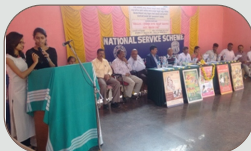
Free health check-up program held at Kommanalu village, in joint collaboration with Government Mc Gannhospital, N C D division & Malnad cancer hospital Shivamogga on 14 th Nov 2017.