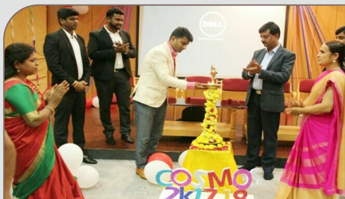
Department forum COSMO inauguration held on Sept 8 th 2017