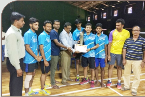
Badminton Men team participated at VTU Central Karnataka zone Badminton tournament held at KIT, Tipturu on 4 th & 5 th September 2017 & Bagged First place.