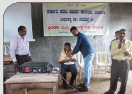
Talk at Govt PU College, Maluru