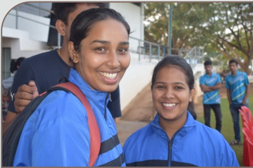
2 JNNCE, Power lifting Women team has Bagged 2 Medals in VTU Power lifting competition held at SIT, Tumkur from 15 th to 17 th Sept 2017.