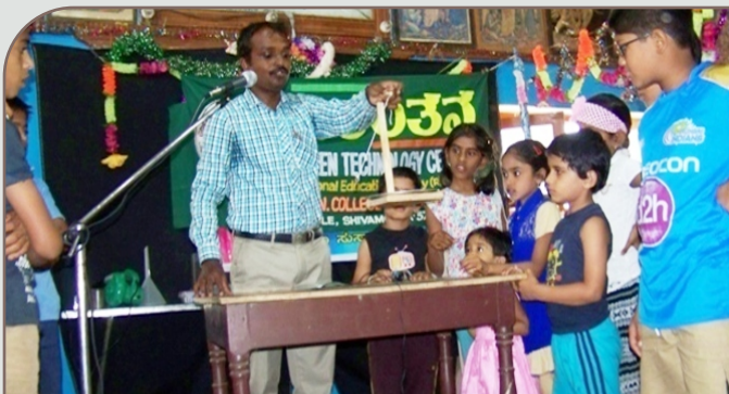
Science Demonstration at Lingadhahally