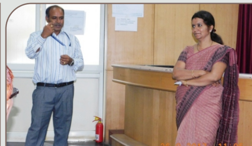
Placement Officer and HOD Interacting With Parents during Parent Teachers Meeting held on 26 th Sept 2017