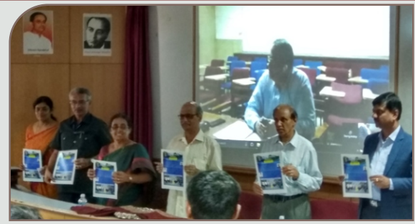
Release of JNNCE Newsletter