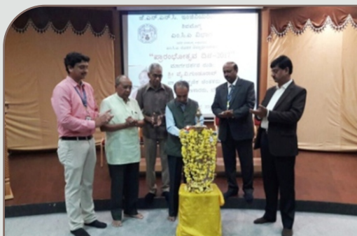
Inauguration of Orientation day on 9 th October 2017 by Sri. Y V Gundu Rao