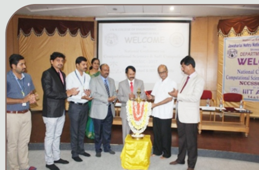
National Conference on “Computational Sciences and Soft Computing NCCSSC” held on 14 th and 15 th Dec 2017

National Conference on “Computational Sciences and Soft Computing” was held on 14 th and 15 th December 2017 at JNNCE, Shivamogga. Papers presented at the conference by JNNCE staff.