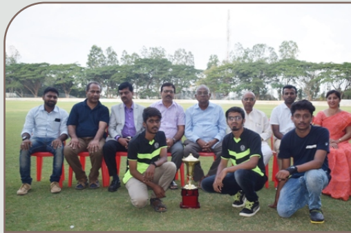
JNNCE, Taekwondo Men team has Bagged 3 Medals in VTU Taekwondo competition held at VemanaIT, Bangalore on 9 th & 10 th Nov 2017