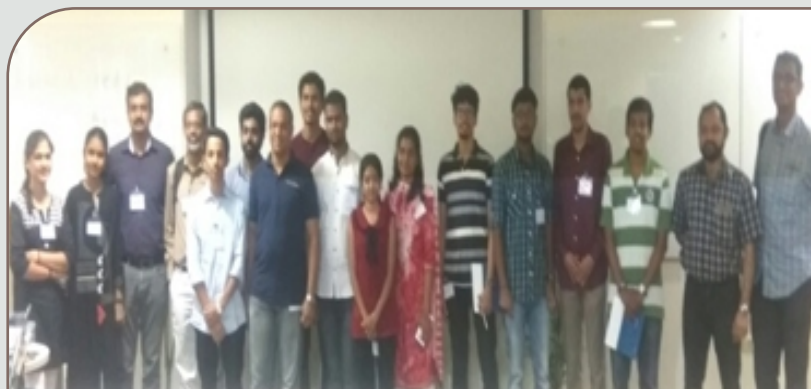
Final year students in IoT (Internet of Things) Project Day