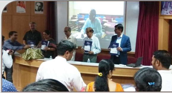
Release of JNNCE Journal (JJEM)