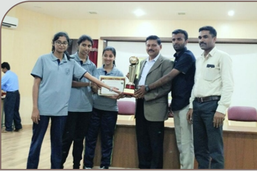
Table Tennis Women team participated at VTU Central Karnataka zone Table Tennis tournament held at AIT, Chikkamagalur on 28 th & 29 th August 2017 & Bagged Second place.