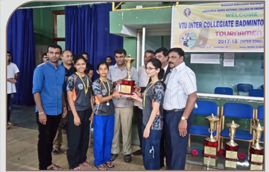
Badminton Women team participated at VTU Central Karnataka zone Badminton tournament held at KIT, Tipturu on 4 th & 5 th Sept 2017 Bagged First place . Also Bagged First place at Inter zone, JNNCE, Shivamogga on 8 th & 9 th Sept 2017.