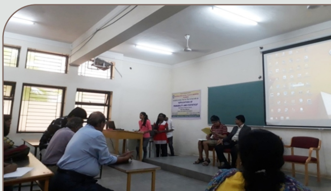
Department of Mathematics organized the special lecture series on “Applications of Probability and Statistics” during 18 th Nov 2017.