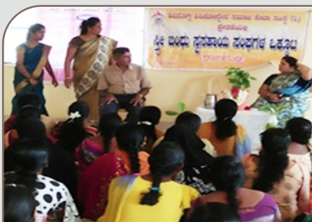
Multipurpose social service organization, Ragigudda, Shivamogga